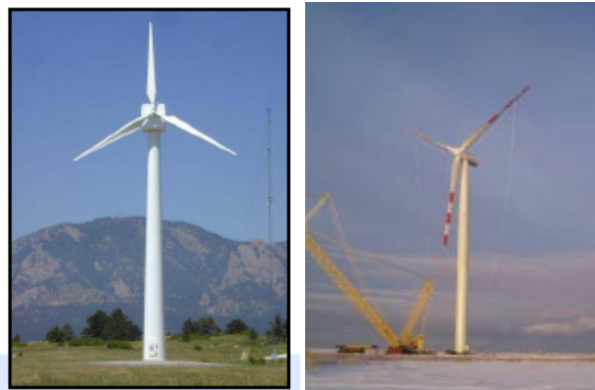
Figure 3. Examples of turbines designed for cold climate. Northern Power Systems 100 kW direct drive wind turbine and Winwind 3 MW turbine