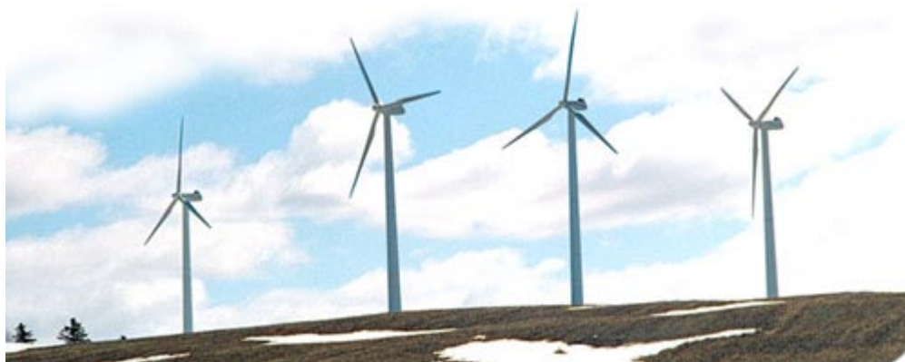
Figure 1. Cold climate wind farm in Canada, Hydro-Quebec.

Considering the vast energy production potential at cold climate sites, it is likely that future wind energy projects, to an increasing extent, will be implemented at these locations. The economics of such projects have become more competitive, in relation to coastal and low land projects, due to increased experience, knowledge and improvements in cold climate technology.